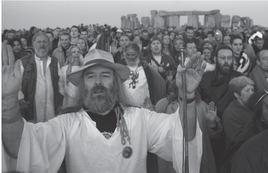
2. A 'New Age' gathering at Stonehenge